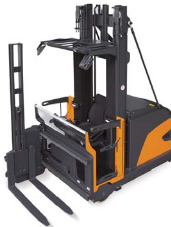
Genius ac capacity 1.0 - 2.0 t MAN UP VNA TRUCK lifting height up to 15.000 mm