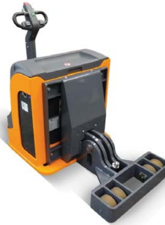
730T/TB/TK ac towing capacity up to 12 t lifting capacity 6.0 t