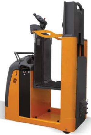
620 PM-T ac towing capacity 4.0 t lifting operator support platform 1.200 mm