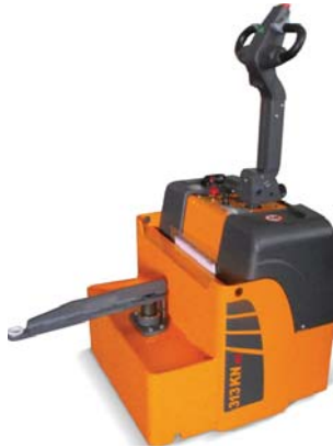
313 KN-T ac – 320KN-T ac towing capacity 1.0 - 2.0 t lifting capacity 0.5 - 1.0 t