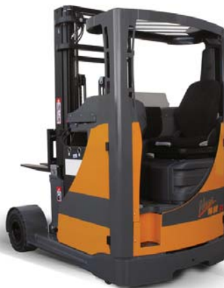
Neos II 16 - 20 SE ac capacity 1.6 - 2.0 t SUPER-ELASTIC WHEELS lifting from 4.160 to 8.210 mm