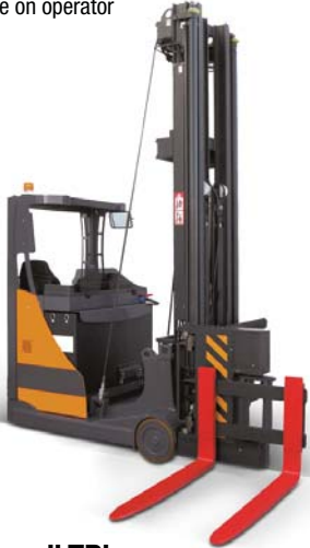
Neos II TRI ac capacity up to 1.5 t MAN DOWN VNA TRUCK lifting height up to 8.920 mm