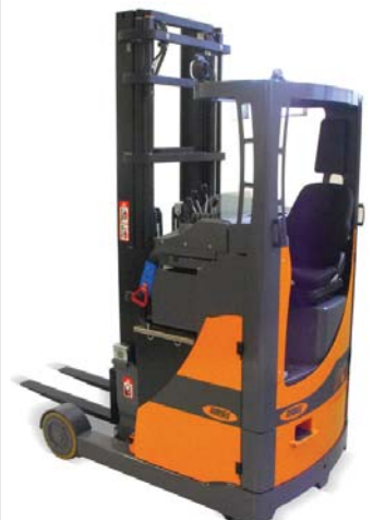
Neos II ac two-wheel drive capacity from 2.5 t TWO-WHEEL DRIVE REACH TRUCK lifting up to 6.700 mm