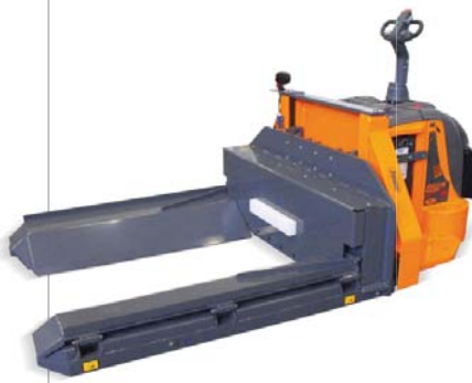
325P5 ac reels handling capacity up to 20 t REELS AND COILS HANDLING TRUCK for different coils and reels diameters