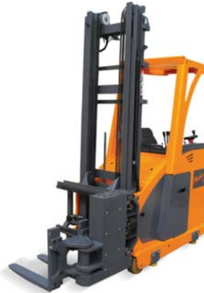
Modus TRI ac capacity up to 0.3 t THREE LATERAL RIDE ON STACKER aisle dimensions from 1.000 mm lifting height up to 3.400 mm