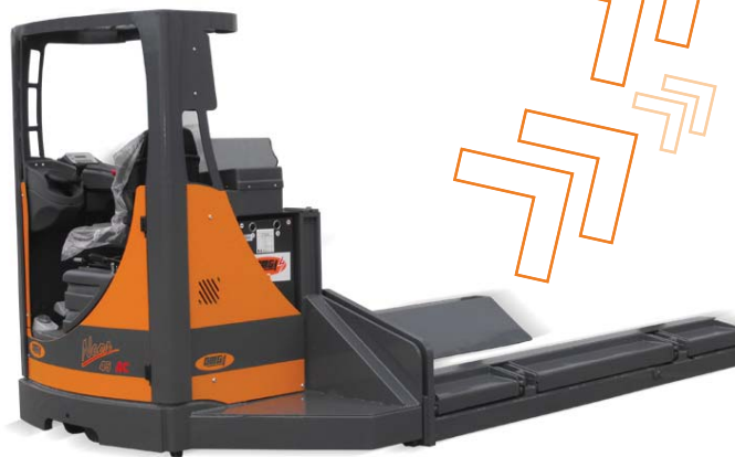
Neos II 45 capacity up to 20 t REELS AND COILS HANDLING TRUCK for different coils and reels diameters