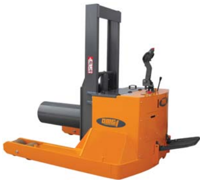
775 BLK with boom capacity 15 t HIGH CAPACITY REELS AND COILS HANDLING TRUCK lifting height upon request for different coils and reels diameters