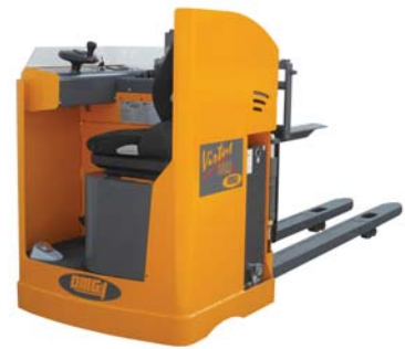
VIRTUS R-C ac with personalized forks capacity upon request HORIZONTAL ORDER PICKER WITH MAST AND SHORT FORKS forks length up to 2.400 mm