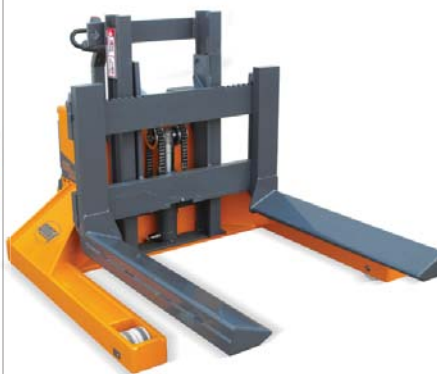
730 BLK reels handling capacity up to 10.0 t REELS AND COILS HANDLING TRUCK for coils and reels of different diameters lifting height upon request

OMG is a leading company in the field of customized and niche equipment for special applications: products that can't be found elsewhere, are fully present in the range.