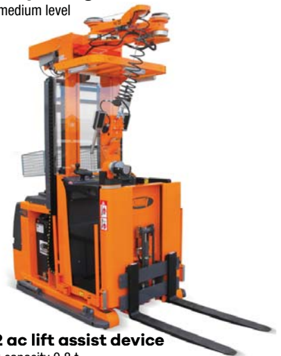
602 ac lift assist device truck capacity 0.8 t arm capacity upon request VERTICAL ORDER PICKER WITH LIFT ASSIST DEVICE lifting platform upon request