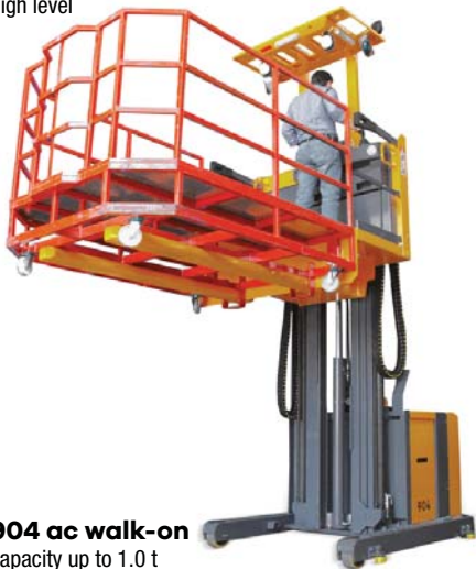
904 ac walk-on capacity up to 1.0 t VERTICAL ORDER PICKER WITH WALK-ON STRUCTURE different solutions available