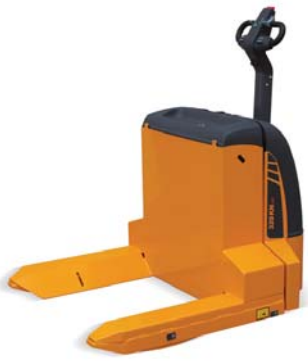
320KN ac reels handling capacity 2.5 t REELS AND COILS HANDLING TRUCK for different coils and reels diameter