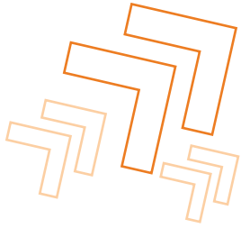
electric tow tractor operator accompanied