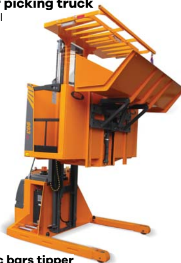
903 ac bars tipper capacity 0.8 t - tipper capacity 0.2 t BARS TIPPER VERTICAL ORDER PICKER TRUCK lifting platform up to 9.000 mm operator's cabin up to 6.000 mm wide