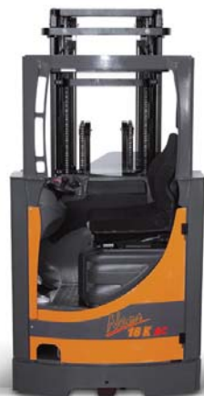
Neos II 13 K ac -16 K ac capacity 1.3 - 1.6 t CHASSIS 1.150 mm lifting from 4.165 to 8.215 mm